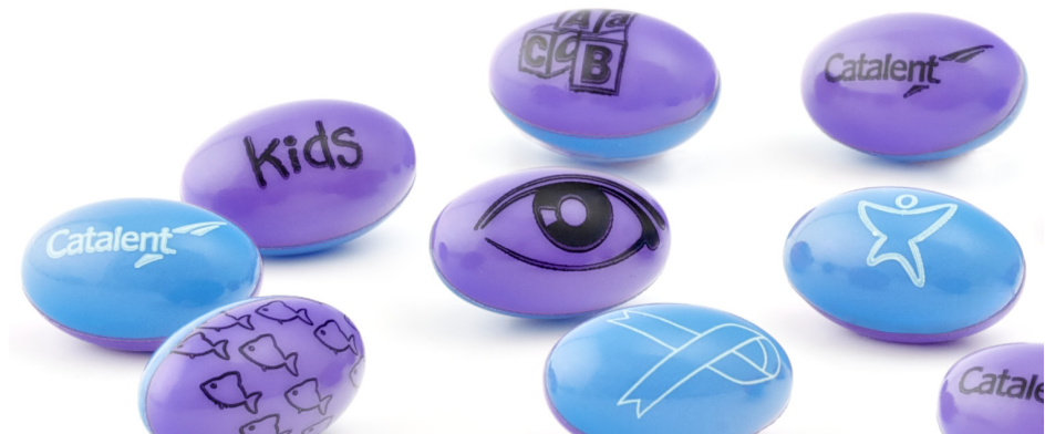
GRAPHICAPS™ INLINE PRINTING EXAMPLES

*Patents have been granted globally in 24 countries covering Europe, Australia, USA, South America, Latin America, Japan and South Korea covering the inline printing capability and machine set up parameters (US7213511, US6769226).